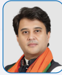
Jyotiraditya M Scindia Minister of Communication; and Development of North Eastern Region Government of India