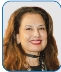
Ritu Beri Indian Fashion Designer