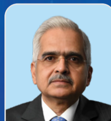
Shaktikanta Das Principal Secretary-2 to the Prime Minister of India

AIMA- Special Award for Public Service Excellence