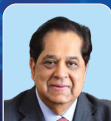
K V Kamath Chairman Jio Financial Services Ltd

AIMA Life Time Achievement Award for Management