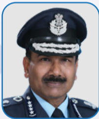
Air Chief Marshal Arup Raha (Retd.) PVSM AVSM VM ADC Former Chief of the Air Staff of the Indian Air Force and Former Chairman of the Chiefs of Staff Committee