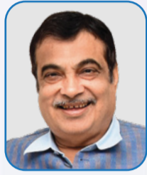
Nitin Jairam Gadkari Minister of Road Transport & Highways Government of India