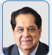
K V Kamath Chairman Jio Financial Services Ltd